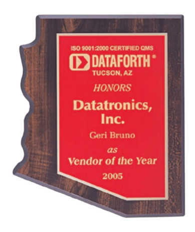
DATAFORTH "Vendor of the Year"