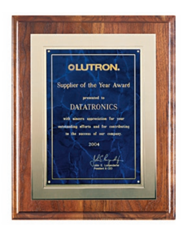
LUTRON "Supplier of the Year"