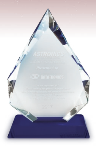
ASTRONICS "Customer Intimacy Strategy"