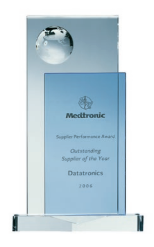
MEDTRONIC "Supplier of the Year"