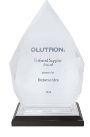
LUTRON "Preferred Supplier"