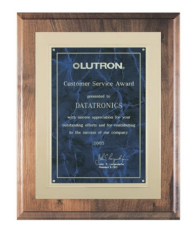
LUTRON "Customer Service"