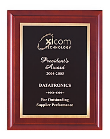
XICOM "President's Award"