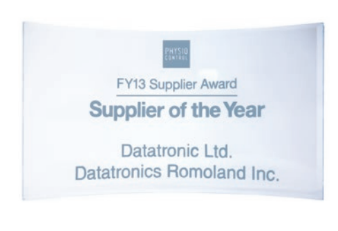
PHYSIO CONTROL "Supplier of the Year"