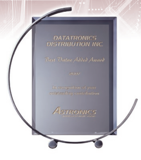
ASTRONICS "Best Value Added"