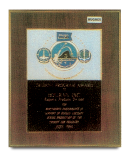
Hughes Aircraft General Motors