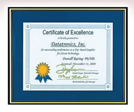
XICOM "Outstanding Performance"