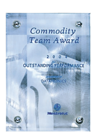
MEDTRONIC "Outstanding Performance"