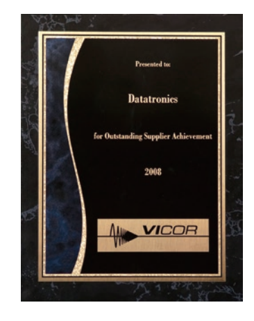
VICOR "Outstanding Supplier Achievement Award"