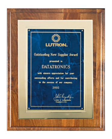
LUTRON "Outstanding New Supplier"