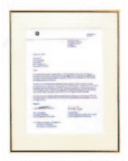
Preferred supplier General Electric