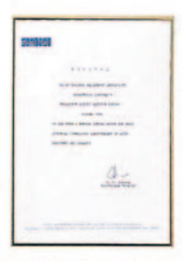
Digital Equipment corp