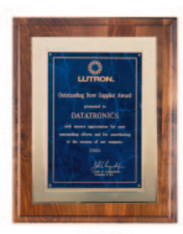
LUTRON "Outstanding New Supplier"