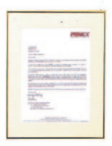
Preferred supplier Primex Aerospace