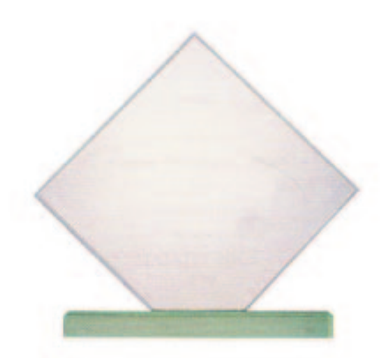
Physio Control (Div. of Medtronic)