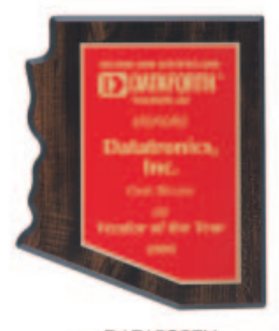
DATAFORTH "Vendor of the Year*