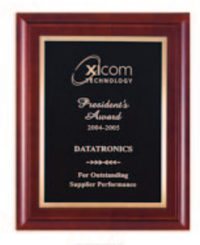
XICOM "President's Award"