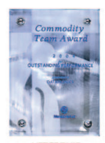
MEDTRONIC "Outstanding Performance"