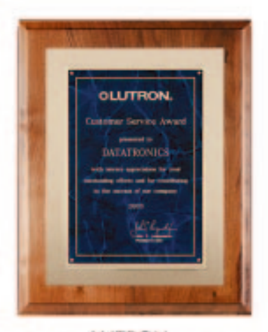
LUTRON "Customer Service"