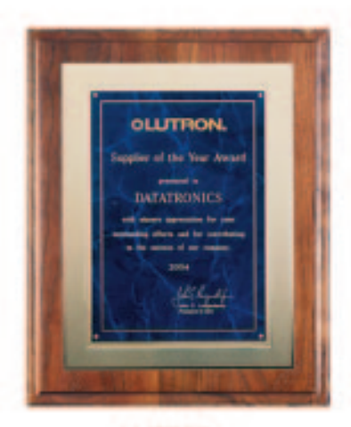
LUTRON "Supplier of the Year"