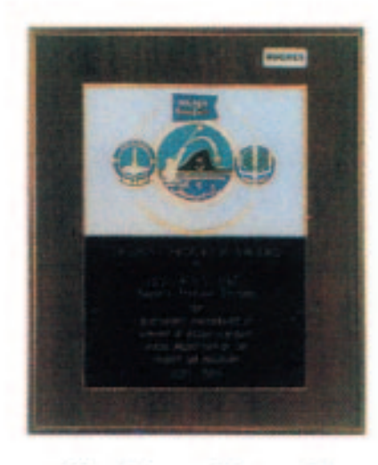
Hughes Aircraft General Motors